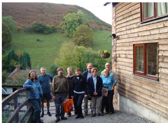
All Stretton.